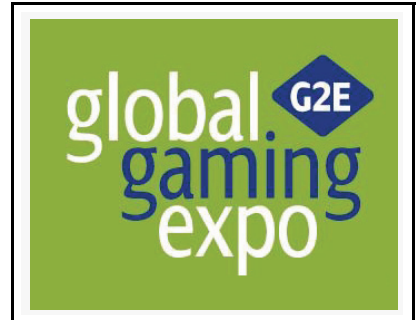
Expo 2006 Logo

JCM has become the first gaming company to have their training department earn International Association for Continuing Education and Training certification. Students that successfully complete this program and receive certification will be eligible for Continuing Education Unit credit acceptable at many colleges and universities toward a technical degree.