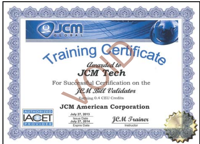
Figure 3: JCM® Global Training Certificate (sample)