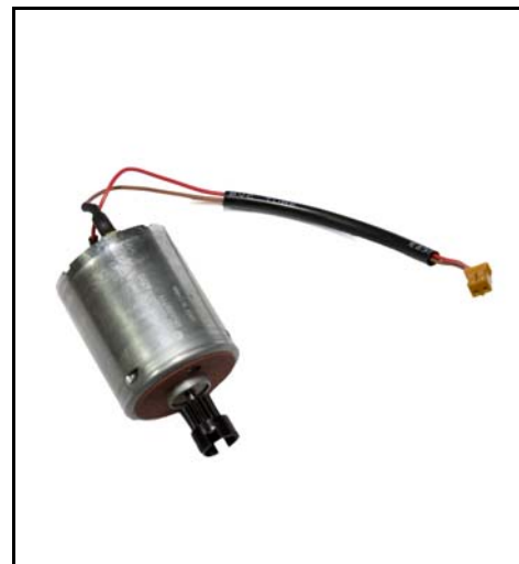
Figure 2: Original UBA Transport Motor EDP# 106441