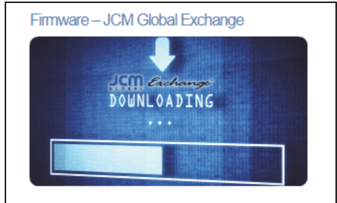
Click on the Firmware - JCM Global Exchange Site Logo

For additional information on JCM Products, visit the JCM Global website at www.jcmglobal.com , or contact your local JCM Sales Representative at (800) 683-7248.