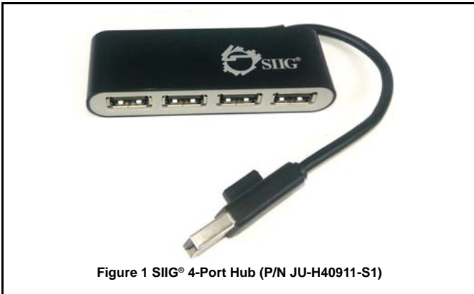
Figure 1 SIIG® 4-Port Hub (P/N JU-H40911-S1)