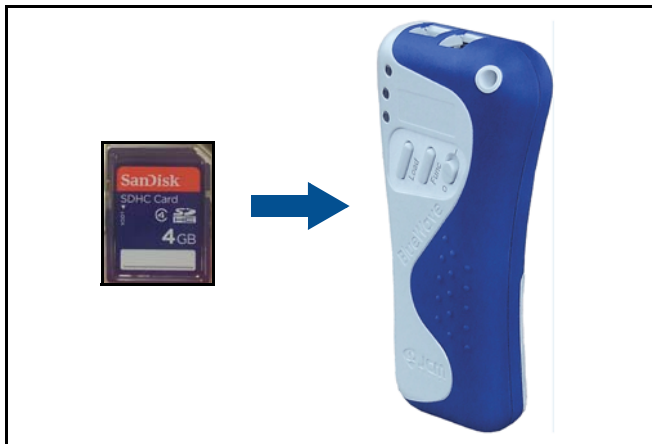
Figure 1: 4 GB SDHC Memory Card / BlueWave 2.0 Download Tool